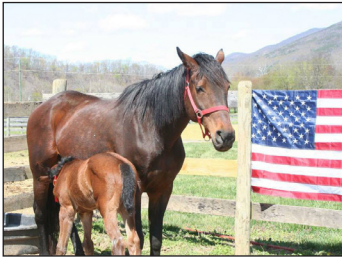
Martha & George Washington